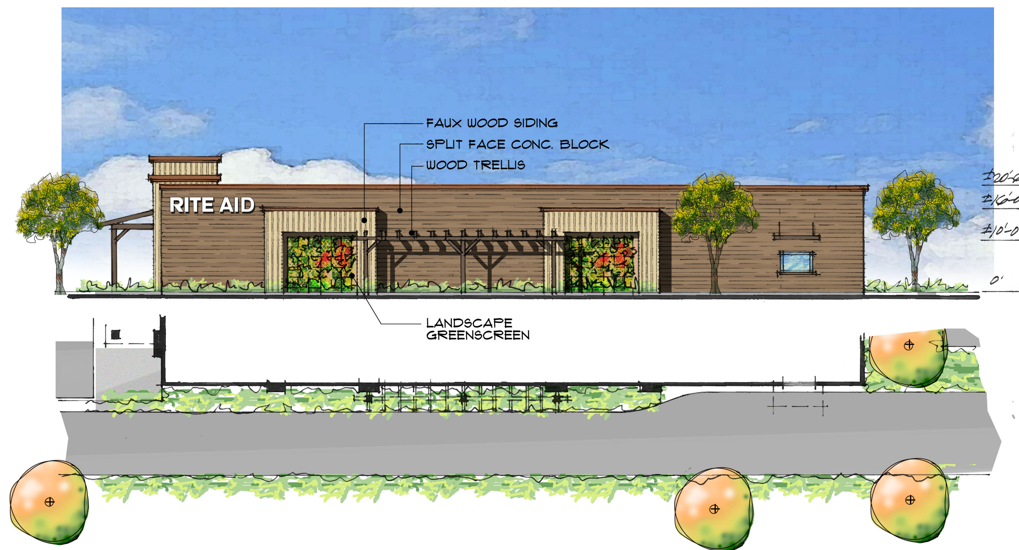
④ NORTH ELEVATION SCALE: 3/32" = 1'-0"