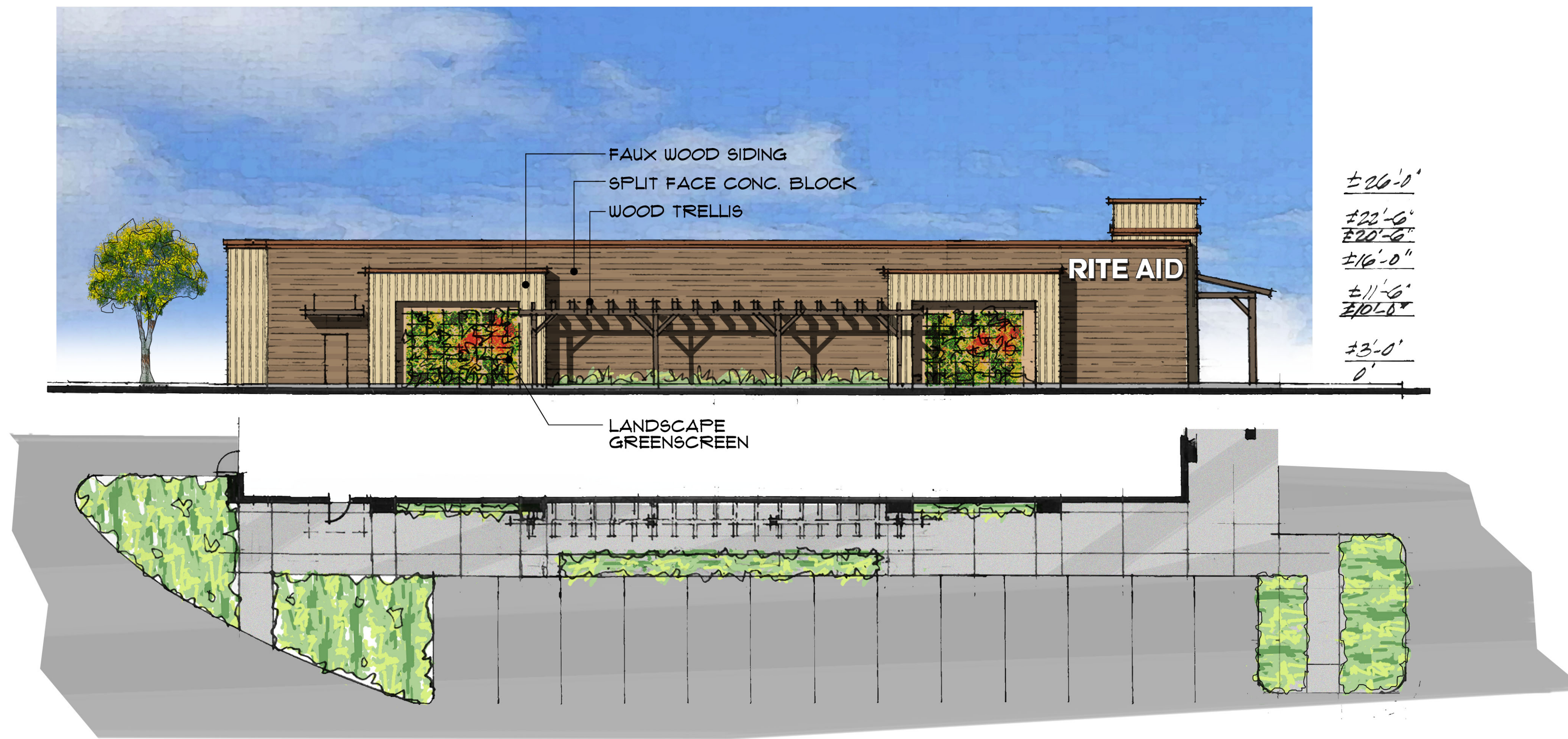
② SOUTH ELEVATION SCALE: 3/32" = 1'-0"